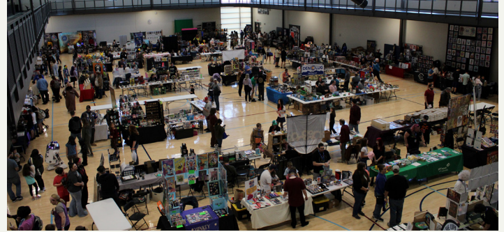
MiniCon event - Columbine Award